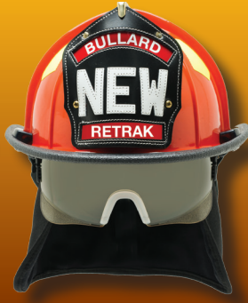
ReTrak Faceshield in deployed position