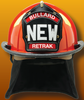
ReTrak Faceshield in stowed position